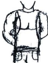
No muscle shirts