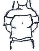
No off-the-shoulder tops