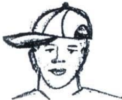
No wearing hats