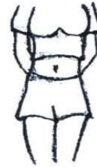
No short skirts or shorts