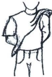
No wearing of one sleeve