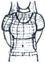
No see-through or fish-net tops