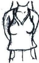
No halter tops