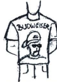
No profane/vulgar, discriminatory words/pictures or references to drugs/alcohol