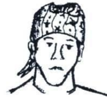
No bandanas, do-rags, wave caps or hair nets